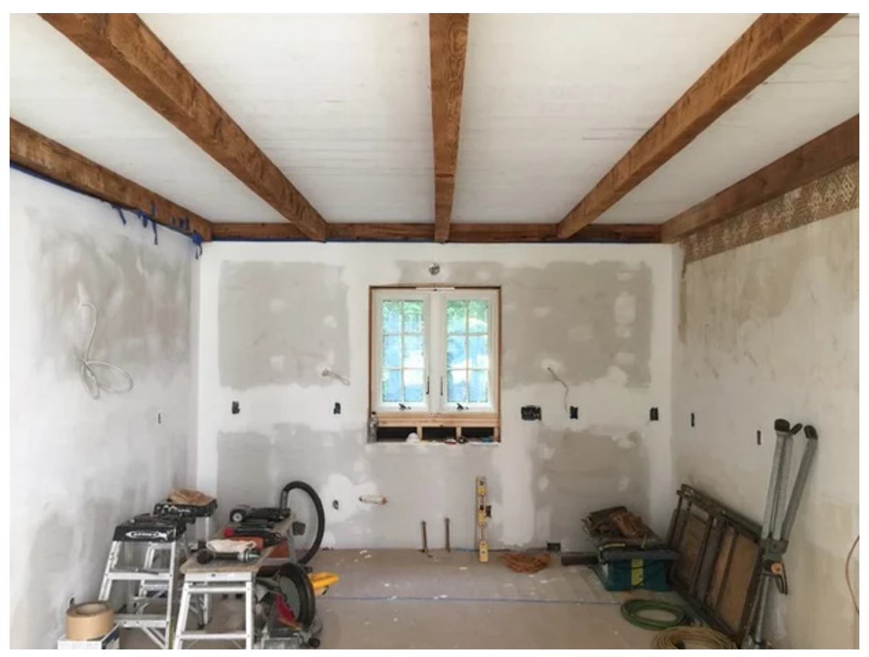
This story was inspired by this kitchen

Home remodeling pros and those who have been through a kitchen remodel agree that the best way to get through it is to flee and stay somewhere else. But this option is not always viable, so here is what to expect if you have to live in your house through a remodel and how to prepare for it.