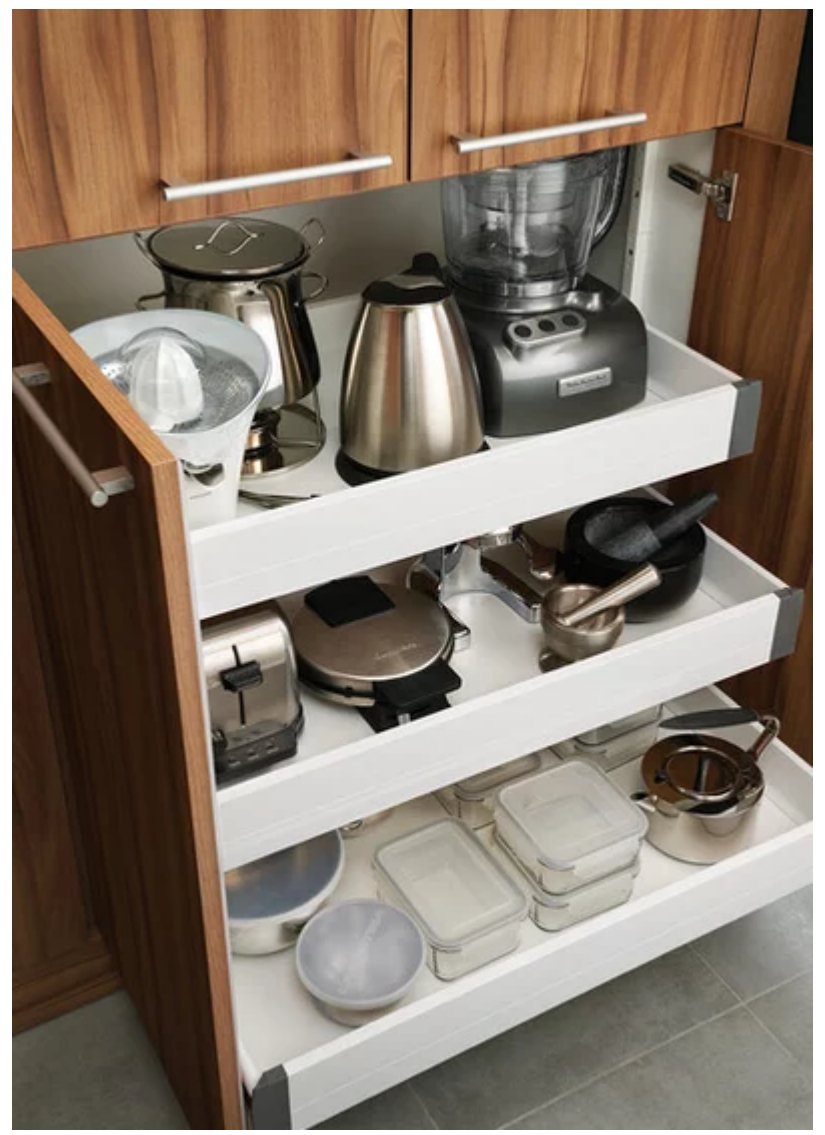
Make Preparations and Get Organized

Concentrate on letting go of control because if you try to hold on to it, you're toast. This would be a good time to take up yoga or learn to meditate. In addition to helping you find a calm place mentally, it's a great excuse to get out of the house. Find some good classes or apps and head to the park.